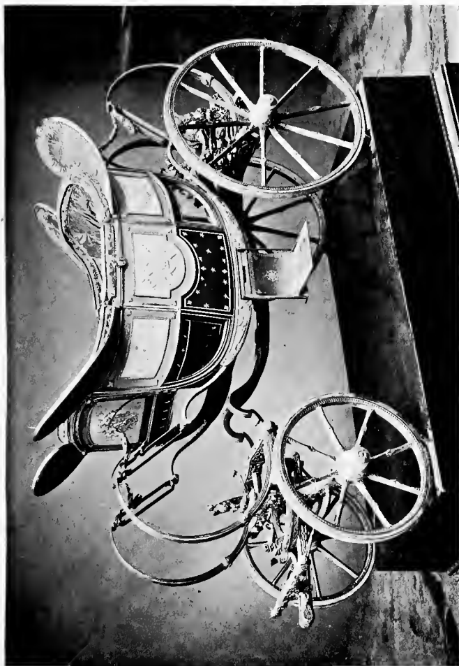
THE DUKE OF REICHSTADT'S CARRIAGE In the Imperial and Royal Stables, Vienna